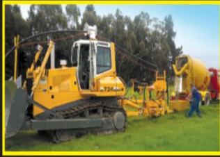
Power, Cable, Fibre and Water installation