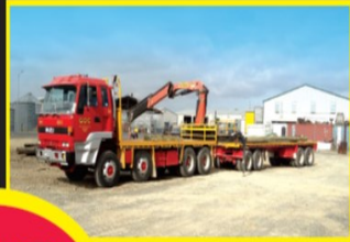
Hiab Hire Truck and Trailer