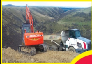
Land Prep and Dairy Conversions