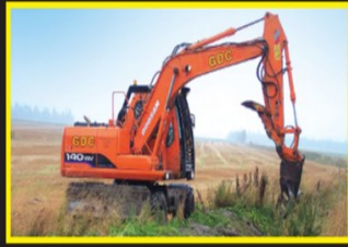
16 ton Wheel Digger - General Farm Maintenance, Mulching and Race Cleaning