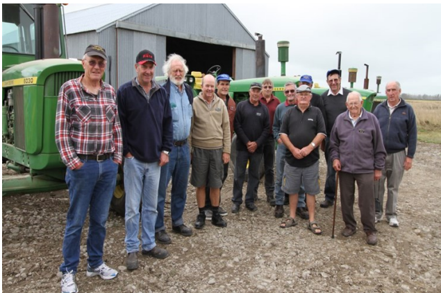
Members of the Taranaki Vintage Machinery Club standing in front of a sea