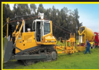
Power, Cable, Fibre and Water installation