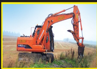
16 ton Wheel Digger - General Farm Maintenance, Mulching and Race Cleaning