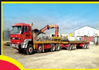
Hiab Hire Truck and Trailer