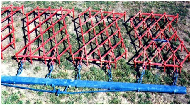
4 leaf set of harrows bought to NZ by Hugh Donaldson

In 1999, Peter Ireland and myself helped restore the sod cottage at Longbeach, we made 150 blocks out of clay, wheat straw and cow dung, mixing this in a concrete mixer and then putting it into moulds to dry.