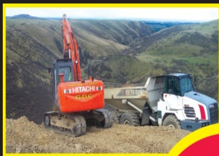
Land Prep and Dairy Conversions