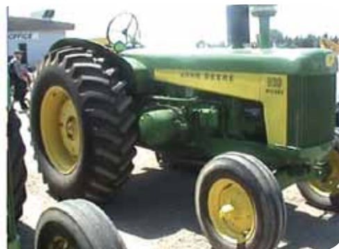
John Deere 830 - $13200