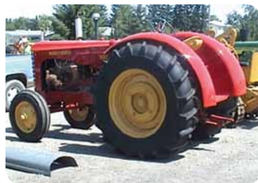
Massey Harris 555 - $6250