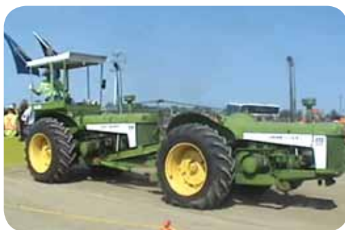
John Deere Tandem 730 Pulling