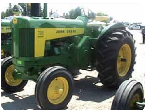
John Deere 730 - $25000