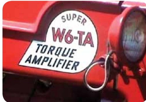
A pulling tractor we don't see many of

It is all lined up to be sold on a 50 acre site, which also includes paint and repair facilities.