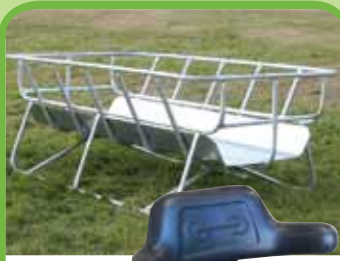
Cattle Feeders 1.8 and 2.5 sizes available